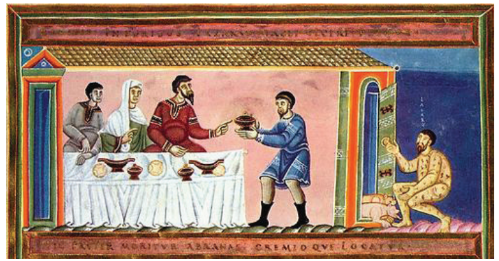
TWENTY-SIXTH WEEK OF ORDINARY TIME